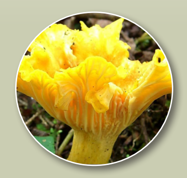
Flame Chanterelle. Jason Hollinger

Urbanization and surface mining reduce the land area available to support outdoor recreation and working forests, while invasive species, climate change, and wildland fire may impact forest productivity.