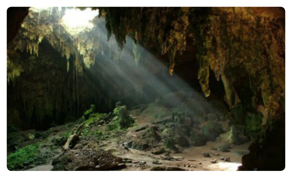
Fern Cave National Wildlife Refuge; USFWS

Protecting the beauty and mystery of caves and karst, as well as the distribution and richness of biological life found within, is a bold, scientific conservation challenge. This landform, distinctive to the Appalachian region, is the gradual result of water dissolving porous bedrock such as limestone. This creates a terrain characterized by springs, caves, and sinkholes that provide habitat for a diverse array of species and are an important source of domestic water supply for Appalachian communities.