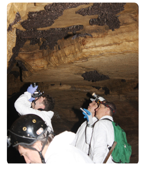
Biologists conduct modern bat surveys by taking photos of large bat clusters.

Since many of these locations are in hard to access areas and with some caves tunneling miles underground, there is a lack of detailed classification and mapping information. This knowledge gap creates a significant barrier for understanding the sheer quantity of caves, their biodiversity, and these ecosystems full contributions to society and the natural world. It is crucial to uncover such information in order to protect these unique landforms and the wealth of hidden biodiversity.