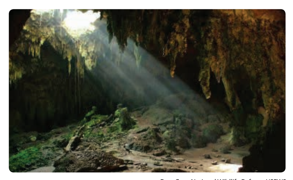
Fern Cave National Wildlife Refuge

of caves and karst, as well as the distribution and richness of biological life found within, is a bold, scientific conservation challenge. This landform, distinctive to the Appalachian region, is the gradual result of water dissolving porous bedrock such as limestone. This creates a terrain characterized by springs, caves, and sinkholes that provide habitat for a diverse array of species and are an important source of domestic water supply for Appalachian communities.