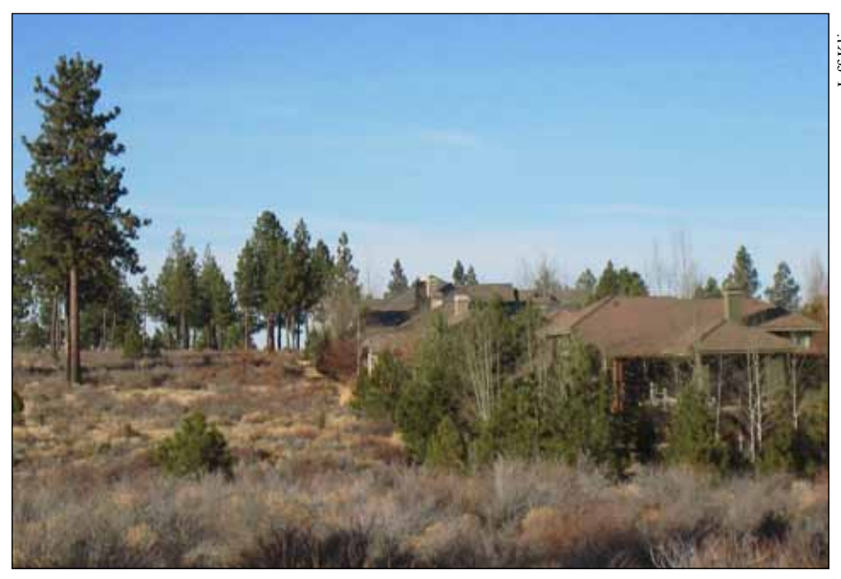
Conservation easements and land use zoning are tools that could be used to maintain existing mule deer migration corridors.

Kline says his projections give landscape planners and managers data to inform their decisionmaking about what conservation measures may be necessary for certain plots of land, given population trends and past devel-