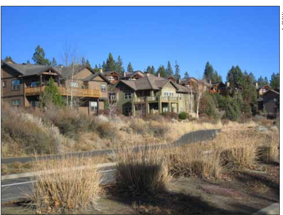
The population of Deschutes County, Oregon, nearly doubled between 1990 and 2010, with most of the growth concentrated around the city of Bend.

The problem is not so much that development is spreading out across the wide area of the deer's winter range, he notes, but that it tends to locate in "key choke points." It affects the deer's ability to move freely among the lower elevation areas where they are accustomed to