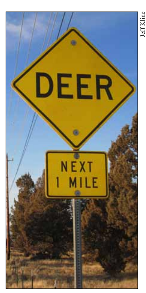
Mule deer outfitted with GPS collars revealed strong fidelity to a particular area, even if it meant crossing major roads to get there.

tered, and data from GPS tracking supports that theory. "Telemetry data show deer moving through another deer's summer or winter area to get to their own, thereby showing their strong fidelity for a particular area," he says. It's the homing instinct in action.