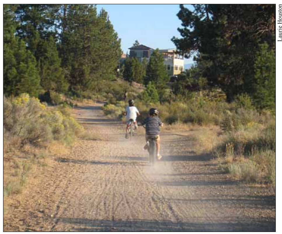
Recreational opportunities in Deschutes County have attracted visitors and new residents but may negatively affect the deer's browsing habits.

Deer are not equipped to handle deep snow, so by the time a foot or so has accumulated in the higher elevations, they migrate down the mountain, attempting to spread out on the desert west and east of Bend. Dodging motor vehicles and finding quality forage in the flatlands are only two of the challenges they face as winter approaches. With each