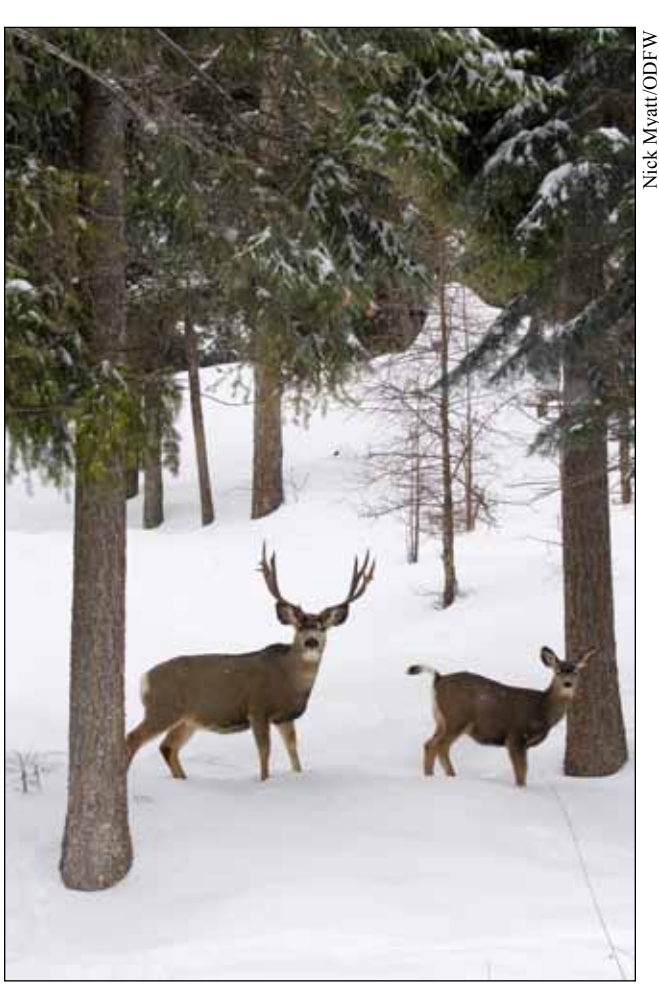
In the winter, mule deer migrate to lower elevations in central Oregon. Roads and residential development are disrupting this migration.

county in 2004 anticipates about 70 percent