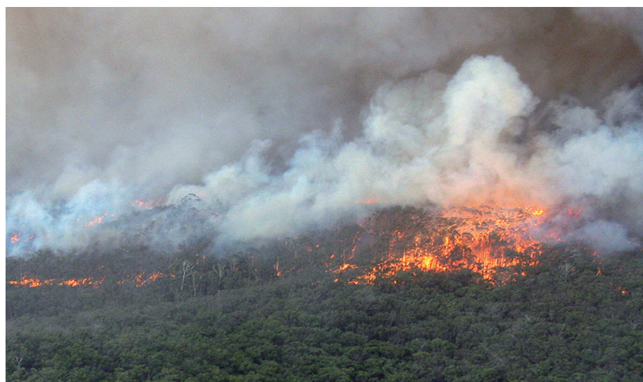
Figure 1 | Fire in the bush. Using a marine sediment core from off the coast of southeast Australia, Lopes dos Santos and colleagues 8 show that changes in vegetation and fire regime occurred 43,000 years ago, after the extinction of the Australian megafauna. They suggest the loss of browsers allowed flammable plant material to build up, promoting biomass burning and a shift to a more fire-tolerant flora.

would have eliminated key nutrient sources for large animals and contributed to their demise. Recent pollen and charcoal records from northeast Australia also show a shift to more fire-prone vegetation following human colonization 5 . However, at this site it seems