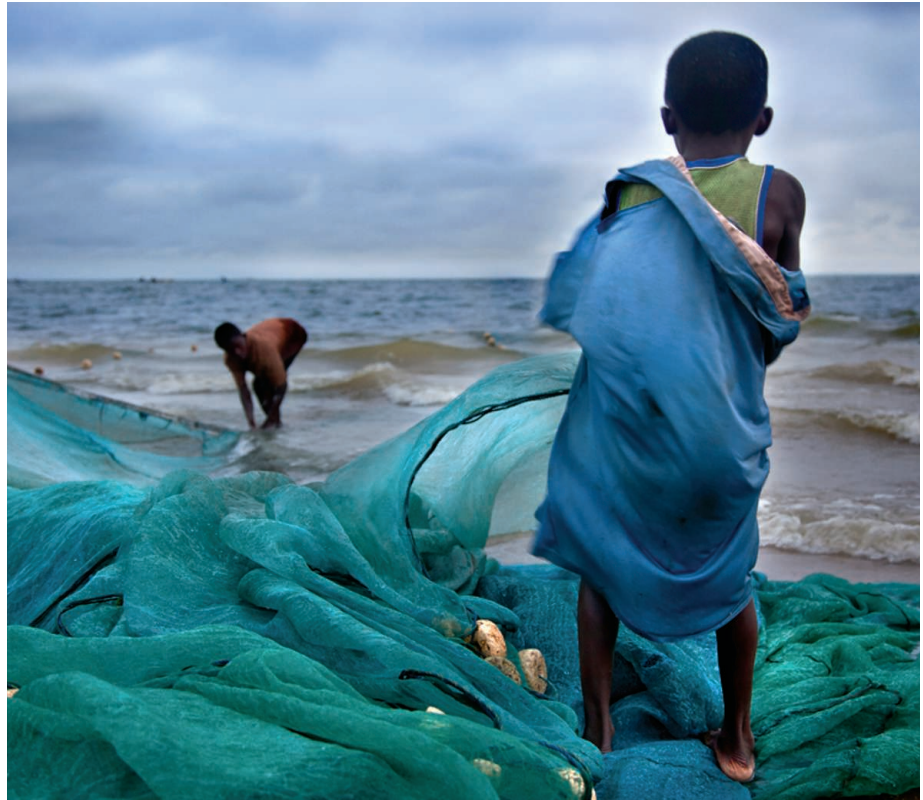
Children enslaved for fishing labor in the Brong Ahafo region of Ghana, 2010.