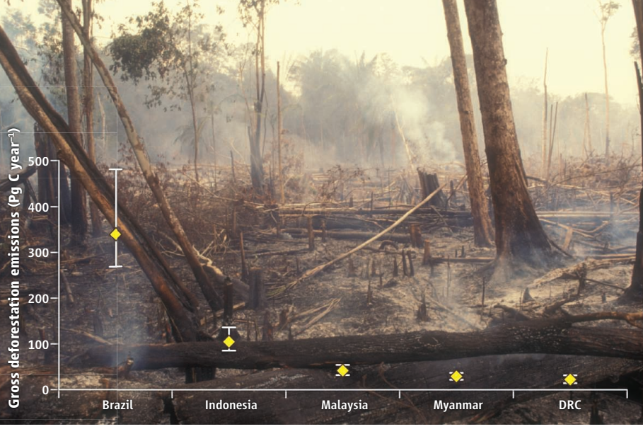
Gross deforestation emissions. Harris et al. provide an independent benchmark for national gross deforestation emissions for 2000 to 2005 [see table S2 in (1)], shown here for the top five emitting countries (peat emissions not included). The 90% prediction interval around those emission estimates is substantial. To reduce that uncertainty, the authors suggest using higher-resolution satellite data to estimate forest cover loss at the country level. DRC, Democratic Republic of Congo.

In 2007, the Intergovernmental Panel on Climate Change (IPCC) concluded that the "best estimate" of net carbon emissions from tropical land use change in the 1990s was 1.6 \pm 0.6 petagrams of carbon per year (Pg C year-1), equivalent to ~20% of greenhouse gas emissions from human activities during that decade (2). That and most other estimates have relied to varying degrees on national self-reporting to the Global Forest Resources Assessment of the United Nations Food and Agricultural Organization (FAO)(3). However, the quality of those data are uneven (4), the reported extent of forest cover and deforestation differs from that found in satellite surveys (5), and the forest carbon estimates are based on a broad set of assumptions (3). Satellite-based analyses of forest cover have since improved estimates of the extent of deforestation across the tropics (6, 7), but satellite data that are sufficient for the task of estimating forest biomass, and hence carbon stock (~50% of biomass), have only recently become available.