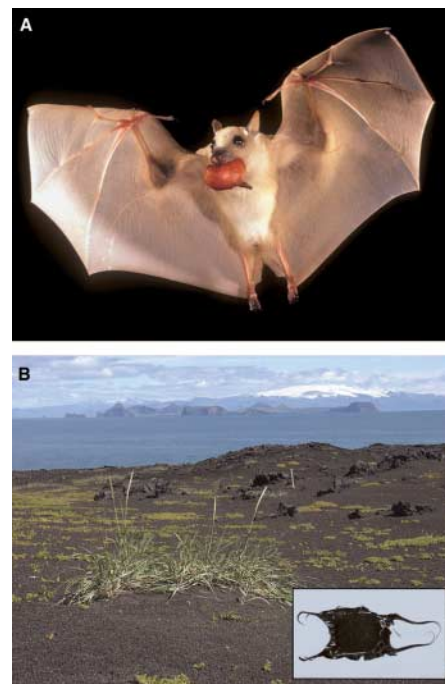
Fig. 1. (A) Epomophorus sp. carrying a fig in Kenya. Large mammals, birds, and bats are traditionally considered LDD vectors. (B) LDD can also be mediated by abiotic factors such as strong storms, floods, and ocean currents that enabled plants such as sea sandwort ( Honckenya peploides ; front and back) and lyme grass ( Leymus arenarius ; middle) to colonize Surtsey, a volcanic island erupted from the ocean 33 km south of Iceland and 4.8 km from the nearest island seen in the background. LDD can also be mediated by “nonstandard” vectors. For example, seeds of five plant species with no known adaptation for water dispersal were drifted ashore attached to a “mermaid’s purse” (inset), the egg capsule of the common skate ( Raja batias ).

(7, 14). More recent studies have shown that long jumps available through rare LDD events are much more influential than the numerous small steps available through local dispersal in determining the spread of invasive species or range expansion of native species after climatic range shifts (6, 15). Rare LDD events also provide the essential link between habitat fragments (12) and facilitate species coexistence—for example, by enabling competitively inferior species to persist alongside competitively superior species through greater LDD capacity (16). In fact, LDD can facilitate coexistence even without such tradeoff between LDD capacity and competitive dominance (13). Indeed, LDD may also be selectively disadvantageous, as it reduces the ability to exclude competitors from occupied patches and to quickly exploit resources in newly available patches (17). Yet over-